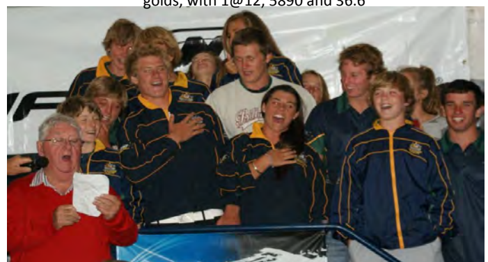
Kiwi U21's had a charge to tie in the 'Boat Race' ... and Ozzy's finished on a high note with their skiing version of 'Australia Fair'